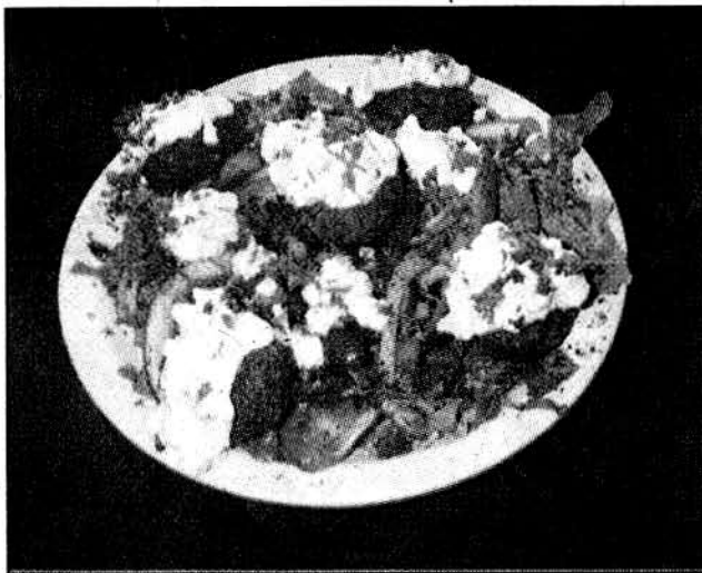
Falafel Platter: Crispy chickpea croquettes served on a bed of lettuce with tomatoes, onions and tahini sauce.